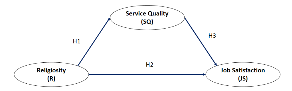
Figure 2. Research Model

According to Now & Bougie (2003)theoretical framework is the foundation on which the entire research project is based. From the theoretical framework can be formulated a hypothesis that can be tested to determine whether the theory formulated is valid or not. Then then further it will be measured by appropriate statistical analysis. Referring to previous theory and research, there is a relationship between variables, including religiosity, service quality, and job satisfaction, so the authors build a research model as Figure 2 follows: